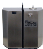
AGF 2.0 iP AGF series aerosol generator with built-in pump