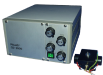
CD 2000 Type B Bipolar discharge unit with higher mixed air flow