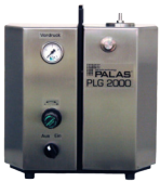
PLG 2000 H Heated version of the PLG 2000 up to 100°C