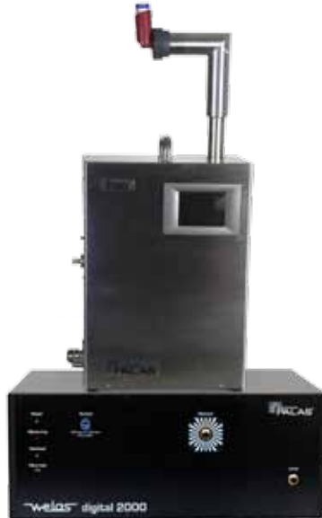
Inas® with welas® digital 2000

The technical basis of this new product is the