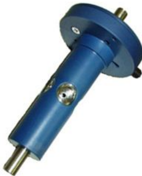
Figure 1: Heatable and pressure-resistant welas ® cuvette

For this reason, the welas ® aerosol sensors welas ® 1100 HP and welas ® 1200 HP are equipped with a pressure-resistant and heatable cuvette to ensure isobaric and isothermal sampling down to the sensor's measurement volume.