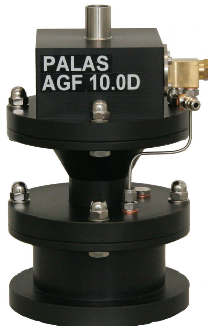
Fig. 1: AGF 10.0 D

Unlike the AGF 10.0, the AGF 10.0 D is pressure-resistant up to 10 bar positive pressure and is thus able to be used for applications with an absolute pressure value of up to 11 bar, e.g. to test compressed air filters and optical flow measurement procedures with positive pressure values of up to 10 bar.