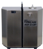
AGF 2.0 iP AGF series aerosol generator with built-in pump