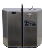
AGF 2.0 iP Version with built-in pump