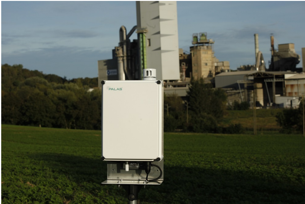
Fig. 1: AQ Guard Smart on a tripod