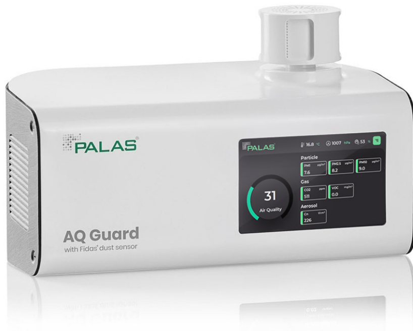
Fig. 1: AQ Guard

AQ Guard, currently the most advanced compact analyzer for determining indoor air quality, continuously and reliably analyses airborne fine dust particles in the range 175 nm – 20 μm (*) IAHP-Package starting from 150 nm). A newly developed mass conversion algorithm calculates PM values based on single particle optical light scattering, taking signal duration and shape into account. Sensor system and algorithms were developed based on the technology of the EN 16450 certified Fidas® 200. The "Ambient" version (with heated aerosol inlet) achieves precision comparable to type approved analyzers, which makes AQ Guard stand out compared to similar devices.