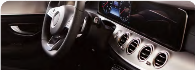
PASSENGER COMPARTMENT FILTER