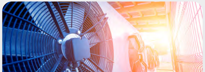
COMPRESSOR SUPPLY AIR FILTER