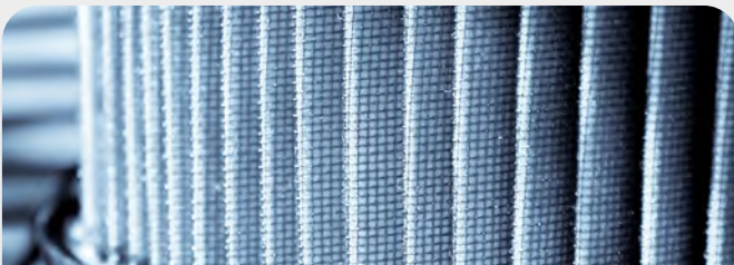
ENGINE AIR FILTER