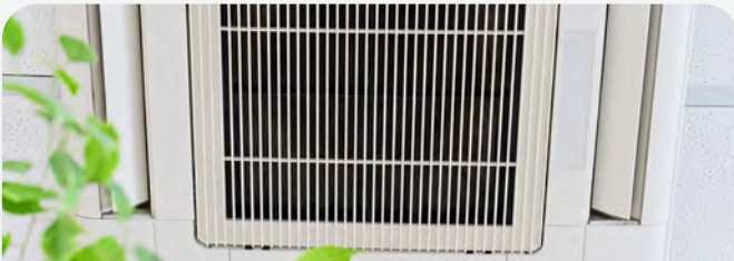
ROOM AIR FILTER