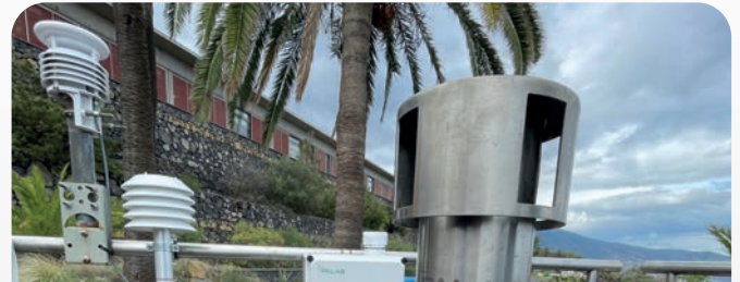
IMMISSION MEASUREMENT CAMPAIGNS