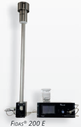
FIDAS ® 200 E

All functions, calculations and controls are managed via an integrated, secured PC (Windows 10 IoT), which offers all the important communication interfaces and protocols. Client-specific adaptations are possible to ensure a future-proof investment.