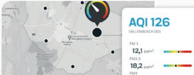
REGULATORY ENVIRONMENTAL MONITORING