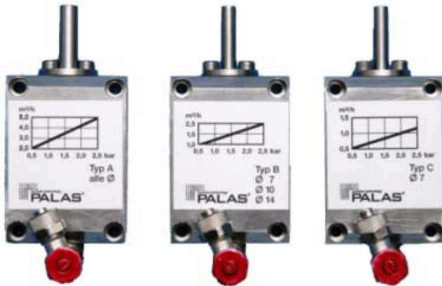
Fig. 3: Dispersing covers, type A, Type B and Type C

Four different dispersing covers can be used for optimal dispersion (see Fig. 3, additional details under “Accessories”).