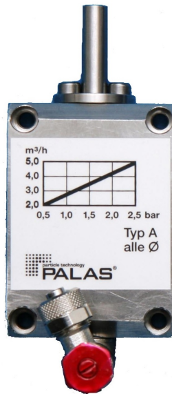
Fig. 3: Type A dispersing cover

Two different dispersing covers can be used for optimal dispersion (see Fig. 3, additional details under "Accessories"), including Type A and Type D.